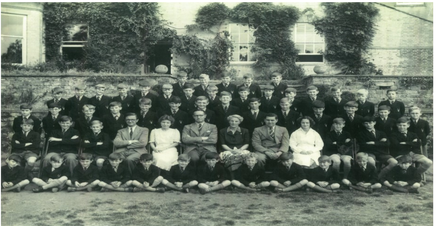
Spratton Hall School 1952